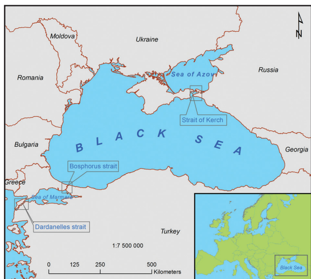
Fig. 1 Location map of the study area

The Black Sea is the largest semi-closed sea bordered by Europe to the North, West and East and by Asia to the South. It is connected by the strait of Kerch to the shallow Azov Sea and with the Marmara Sea (the Mediterranean Sea, respectively) by the strait of Bosphorus (Fig. 1). The Black Sea lies between six countries: Bulgaria, Romania, Ukraine, Russia, Georgia and Turkey.